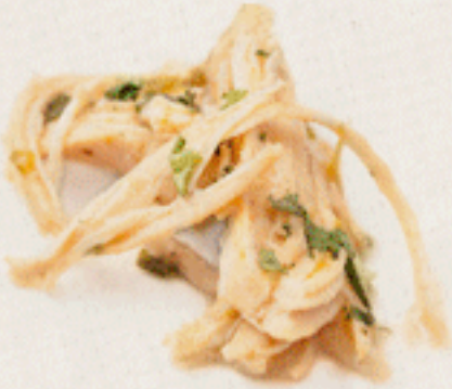
shredded CHICKEN Slow stewed to perfection