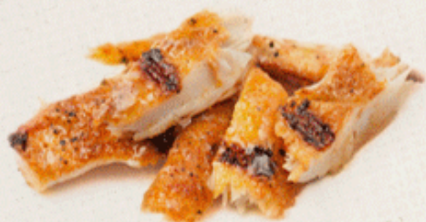
grilled MAHI +$2 Wild-caught