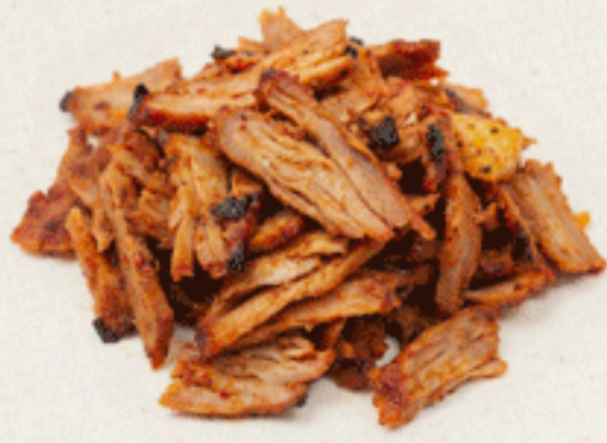
AL PASTOR Marinated pork