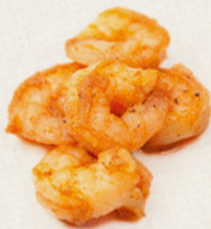
SHRIMP +$2 Nutritious delight