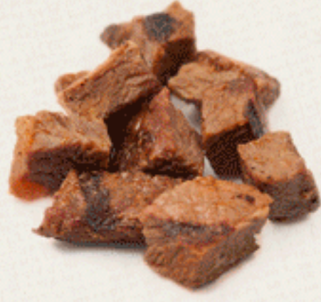
grilled STEAK USDA certified angus