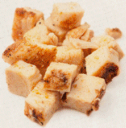
grilled CHICKEN All natural, hormone free