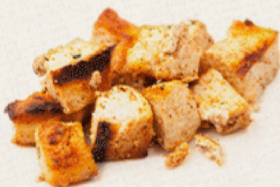
grilled TOFU Vegetarian's fave