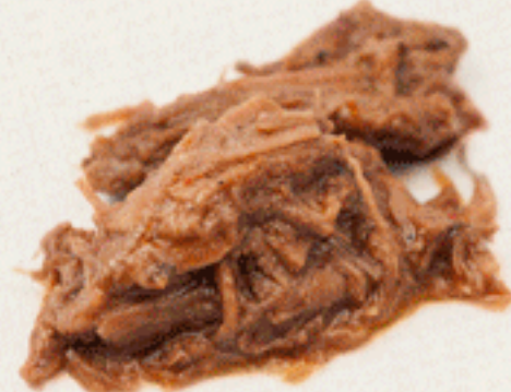
shredded BEEF Sensuous barbacoa