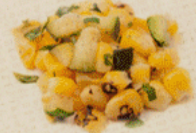
corn + SQUASH