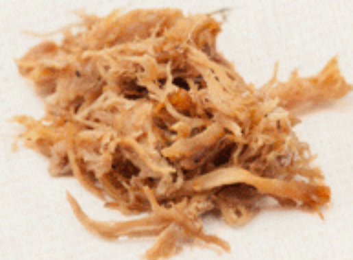
CARNITAS All-natural pork